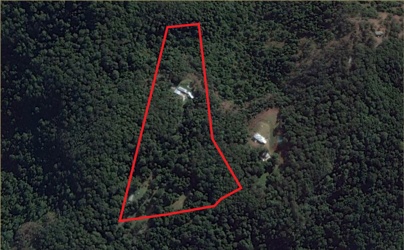
Boundary is approximate area only

756 TREES ROAD, TALLEBUDGERA VALLEY, QLD, 4228